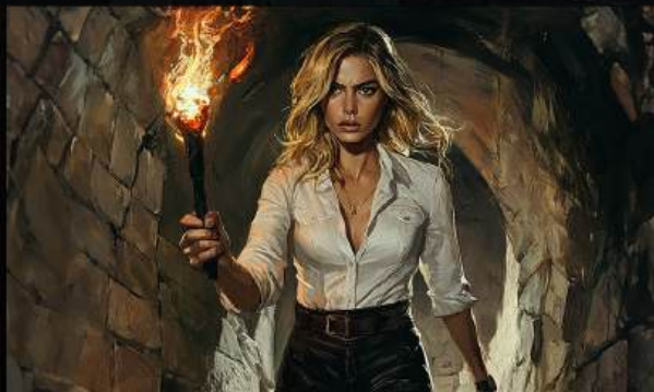
SERAFINE - SUPPORTING