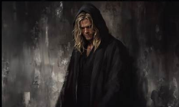
BALOR PAYNE - ANTAGONIST

Father Alex Corbin leads a small parish in Savannah. A deeply spiritual man, he uses his faith to uplift others. When his beliefs are challenged by demonic forces, Alex must fight for his convictions and those he swore to protect. He acts as a moral anchor for the team battling sinister occult phenomena.