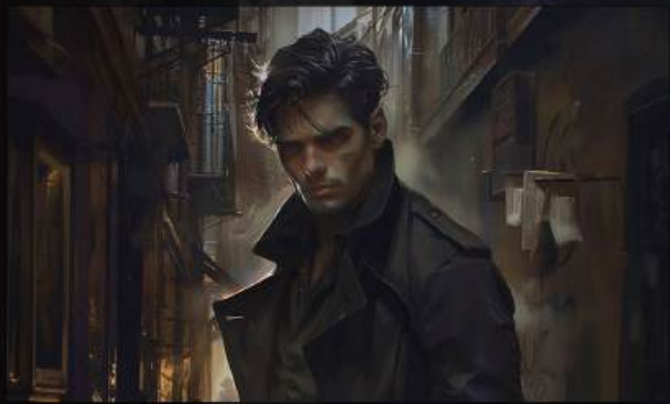
HUNTER ELDRITCH - SUPPORTING

Mara Lawson grew up in Savannah and joined the police force to serve her community. She has an innate desire for truth and justice, often trusting her gut instincts even when others rely only on facts. Mara lost her mother at a young age and poured herself into her police work. She struggles to balance her dedication to her job with having a personal life outside of work.