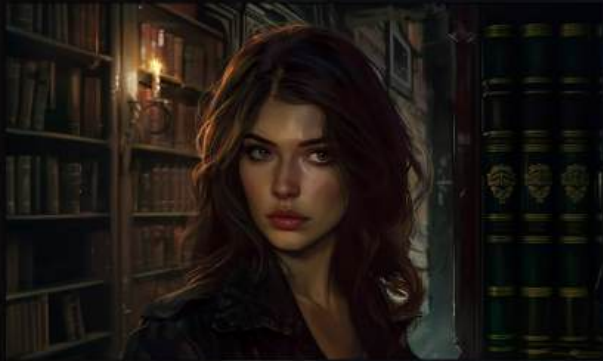
MARA LAWSON - LEAD

Mara Lawson grew up in Savannah and joined the police force to serve her community. She has an innate desire for truth and justice, often trusting her gut instincts even when others rely only on facts. Mara lost her mother at a young age and poured herself into her police work. She struggles to balance her dedication to her job with having a personal life outside of work.